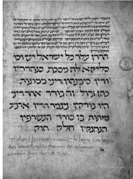
Image 2. Talmud Bavli (Babylonian Talmud), Tractate Sanhedrin, ca 1400–1450 CE. Codex Reuchlin 2, fol. 96v, Badische Landesbibliothek Karlsruhe.

The VTL is in possession of prime presswork representative of the Baghdadi printing houses that produced works of halakhic (Jewish religious law), literary, and liturgical content. Included in this subdivision from Bombay, Calcutta, Poona, and Cochin are broadsheets for Order of Service at the Magen David Synagogue; famine prayers; Blessing of the Sun booklets in Marathi language; a letter in Malabari dialect; a Haggadah lithograph in Hebrew, Judæo-Arabic, and Aramaic; Ecclesiastes in Judæo-Arabic; Benedictions according to the Baghdadi Rite; a lithographed lexicon in Hebrew, Hindustani, Persian, Arabic, and English; a Song of Songs lithograph in Aramaic and Judæo-Arabic; 108 pages of propitiatory prayers and remission of vows in Hebrew and Aramaic;