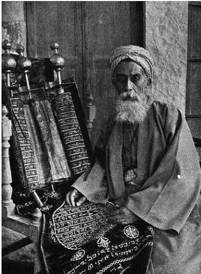
Image 8. High Priest of the Samaritans with Codex Nablus, Palestine. ca. 1920.

A representative work of this nearly extinct sect (with fewer than 800 residing in present-day West Bank [CisJordan] and a Tel Aviv suburb) was on display within the Manuscripts Room: a twelfth-century Samaritan Pentateuch scroll (written in the