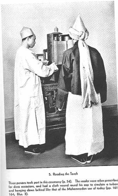
Image 12. Reading of the Torah by Kaifeng Jews.

Sheng province during the Northern Song dynasty (960–1127 CE), residing in regions of Bianjing and Hangzhou during the Yuan Dynasty (1271–1368). From 1000 CE to 1932, Sino-Judaic communities 40 were established in towns of Tun-huang, Lanchow, Tung-ming, Kaifeng, Hangzhou, Changpu, Ningpo, Canton, Shanghai, Harbin, Tianjin, Hong Kong, and elsewhere. Maritime sailors of the Oriental diaspora travelled to China on Arab, Persian, and Chinese vessels between the Tang and Southern Song Dynasties (seventh to thirteenth centuries CE). Jewish soldiers who served were bestowed settlement lands by Emperor Taizu.