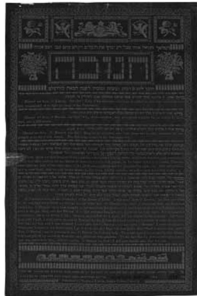
Image 4. Blessings on the Menorah, Calcutta. Late nineteenth century CE. Lithographed blessing sheet, gold ink on red paper.

The Malabar Yehudan (Cochinim) 12 were among initial dispersions of Jews into South India during the time of the United Monarchy and after its division. The Kochini of Kerala —originally of the Tribe of Manasseh—were intercontinental spice traders who first settled along the Malabar Coast of India (ca. 700 BCE, 562 BCE). Thereafter, sometime between the beginnings of the Judæo-Roman rebellion (66 CE), the Roman legion's reconquest (70 CE), and Emperor Hadrian's razing of Jerusalem (135 CE), exiled Israelites arrived en masse from Palestine, disembarking in 72 CE at the port of Cranganore, near Cochin. Yehudeans streamed (ca. 369–490 CE) into the Judaic principality, and inheritors of this privileged property remained until ca. 1524–1534, when segments of the population escaped from Cranganore to seek sanctuary in Cochin during trade disputation with local Moors and from Portuguese subjugation. Living under subsequent Portuguese, Dutch, and British occupations, descendants of the original Malabar Yehudan (of the Indo-Iranian dislocation) made their way beyond Kerala to other states of India.