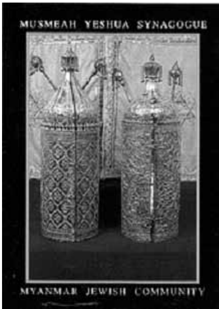
Image 11. Sefrei Torah of the Musmeah Yeshua Synagogue, Burma.

Mandalay, onward to Singapore, Jakarta, Bangkok, Saigon, Manila, Tokyo, Hong Kong, Shanghai, Maimo, Moulmein, Bassein, Akyab, and Toungyi, they increased their wealth and presence. Burma's (Myanmar) Musmeah Yeshua Synagogue once held 126 Sefrei Torah ; only two remain.