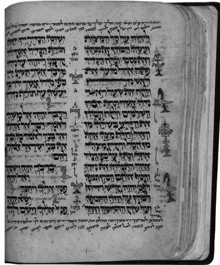
Image 10. The Pentateuch, Yemen, early fifteenth century CE manuscript. Oriental Hebrew illuminated manuscript embellished with motifs and masoretic notes on pronunciation and intonation, Valmadonna Trust Library.