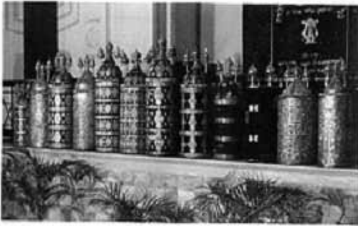
Image 15. Torah Scrolls, Hong Kong Synagogue.

Some of the numerous, multilingual Chinese Jewish publications were Evreiskaia Zhizn (Jewish Life) , Der Vayter Mizrekh (The Far East) , Gadegel, Our Life, Jewish Chronicle , and Jewish Voice of the Far East (Juedisches Nachrichtenslatt) . Inclusive within VTL's Chinese cache are imprints of the Zionist newspaper Israel's Messenger , an Ohel Rachel Synagogue Order of Service: Seder ha-Tefilot Book of Prayer and Order of Service According to the Custom of the Sephardic Jewish Community , Siddur Kol Benei Yehudah , and Pizmonim le-Simhat Torah —all of which are Shanghai selections.