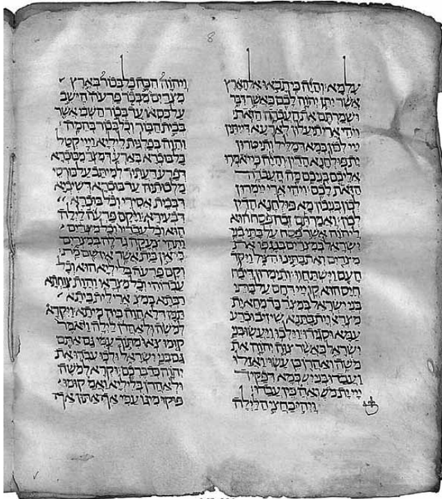
MS 206 Hebrew square book script, Iraq, 1st half of 11th c.