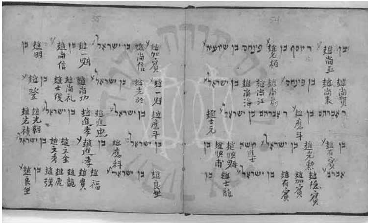
Image 13. Kaifeng Congregation Prayer Book & Members List, Ming Dynasty. HUC Ms 926.