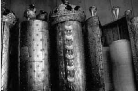
Image 5. Torah Scrolls, India, Cochini Synagogue. Image source: Stephanie Comfort. Used with permission.

There exists a Yehudan record called the Cochin History Roll that records events occurring among this strand of the Manasseh Tribe prior to arrival in India. The Roll accounts for two dispersions—Persia-Medea-China and another northward Eurasian movement—but such manuscript was not located by me within Sotheby's assemblage. The oldest