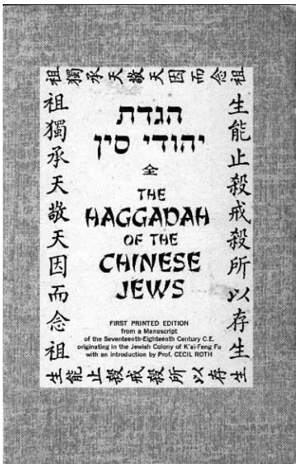
Image 14. The Haggadah of the Chinese Jews. First printed edition from seventeenth century CE manuscript. Image source: Judah L. Magnes Museum. Creative Commons License 3.0.

Difficulties of early Chinese typography involved the requirement of more than 100,000 ancient characters and hieroglyphic symbols to execute standardized, legible text. The running, calligraphic typescript style of the written word in Chinese, Japanese, and Arabic posed problems in earliest printing press attempts. Woodblock printing was not as suitable in Europe as in Asia, where alignment of characters was not as critical. Use of the Latin alphabet required precision and simplicity. Innovations advanced by Gutenberg 43 and others in Netherlands, France, Germany; limitations of Asian typesetting; and selection of the Rashi script as the industry standard impelled the proliferation of Hebrew-language printing and the notable presence of Jews in Sino-Judaic publishing.